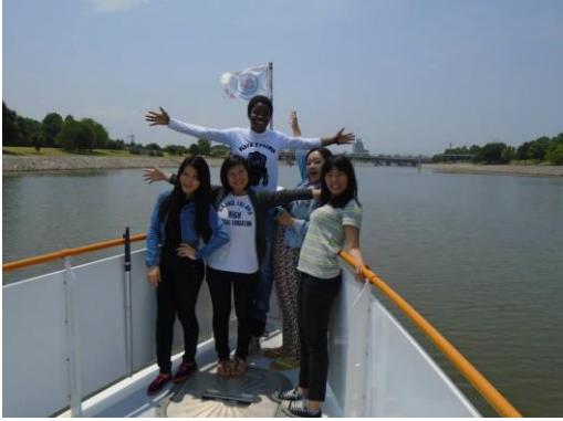
(Some OKC students on a River Cruise)

This fall students will be able to enjoy a cookout at Lake Hefner, a visit to the Cowboy Heritage museum, a visit to the downtown area, and a trip to the movie theater.