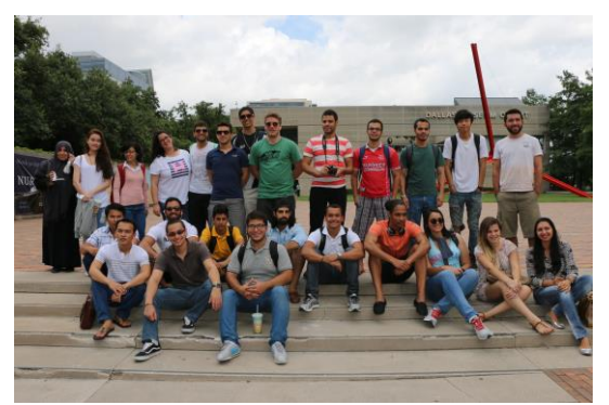
(Dallas Students at Dallas Museum of Art)

At our Dallas campus, students went bowling, visited the Dallas Cowboy football stadium, the Dallas museum of Art, Klyde Warren Park, and created a soccer team and played indoor soccer.